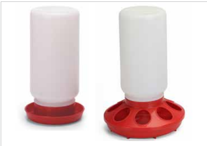
Drinker - Jar Type Chick - 1lt