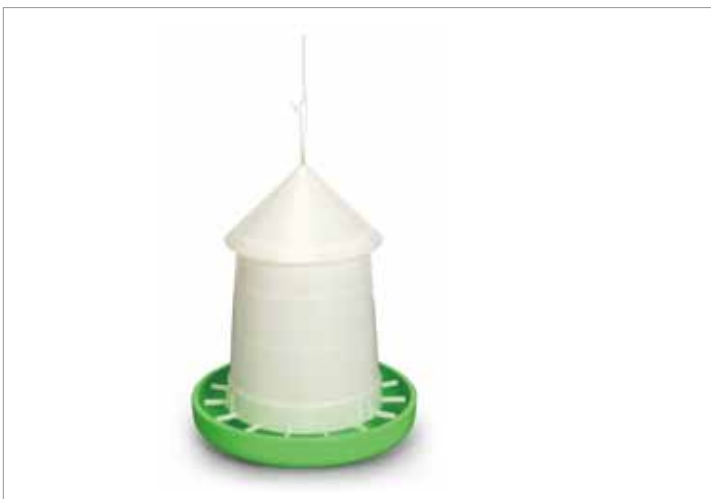
Super Poultry Feeder (adjustable feed - flow) with Hopper Lids