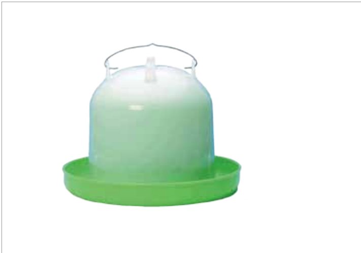
Drinker - Easy Fill - 9ltr Sleeve type drinker with easy fill tank