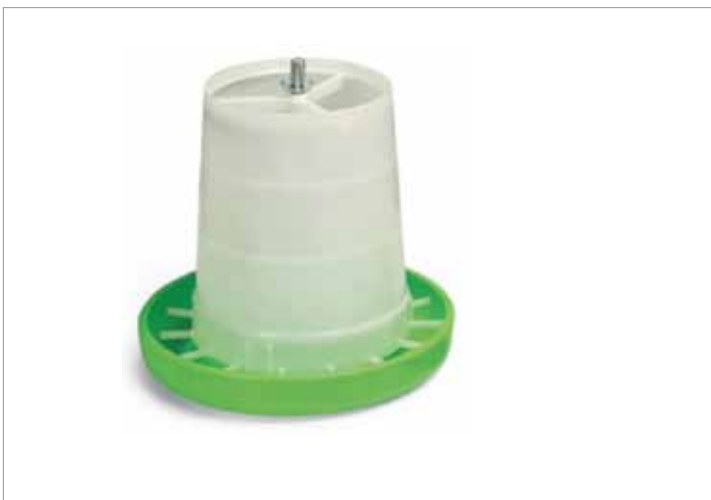
Poultry Feeder Gear Type

Poultry Feeder with plastic hopper and base.